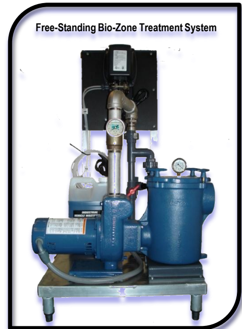
Free-Standing Bio-Zone Treatment System